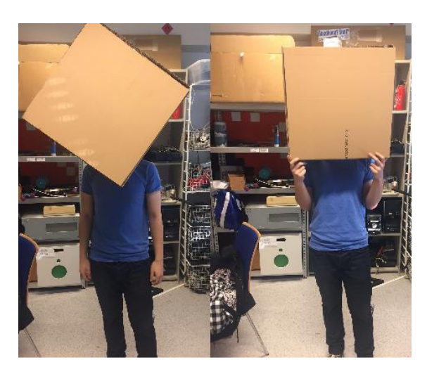
Figure 2: First iteration prototypes for form and fitting purposes