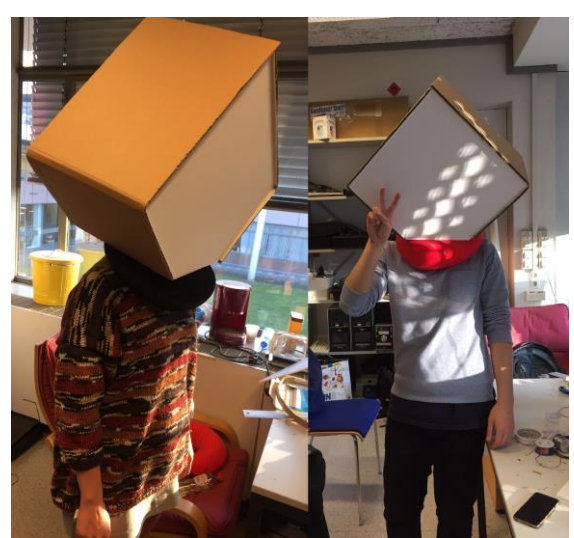
Figure 3: Second prototype